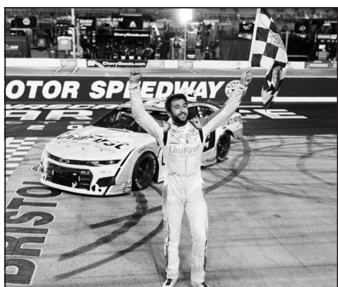
Chase Elliott Gets First All-Star Win

Chase Elliott held off Kyle Busch to get his first NASCAR All-Star Race win Wednesday night at Bristol